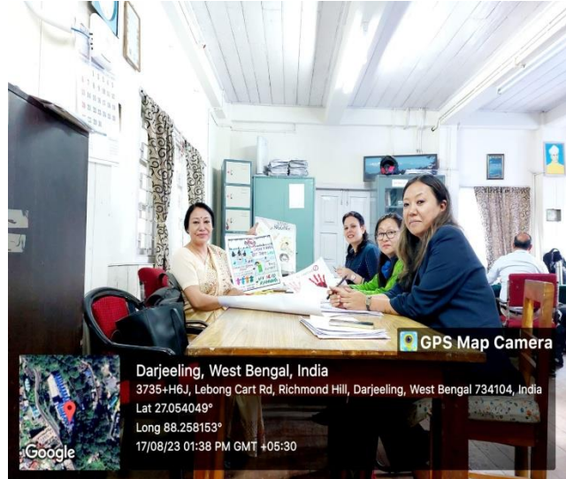
Jury at work – selecting the best poster