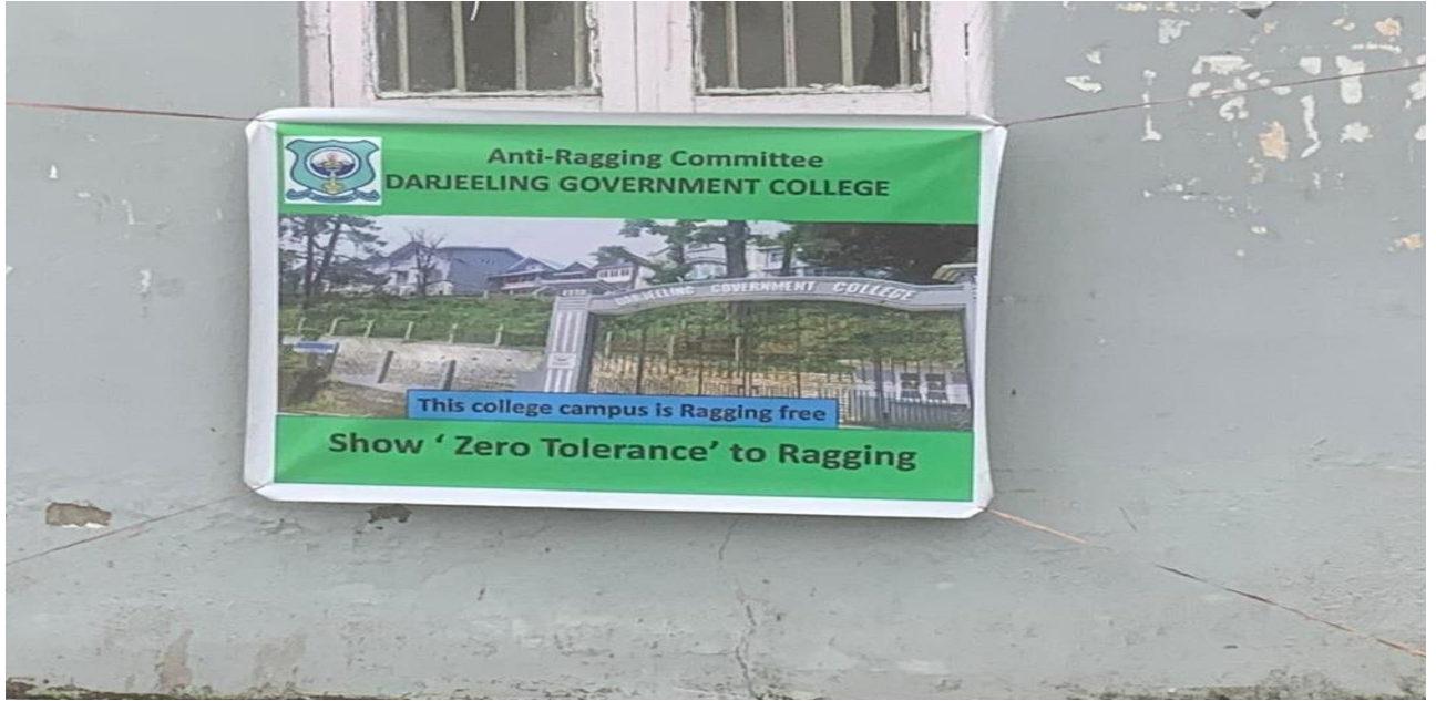
Ragging free campus

Phone / Fax: (0354) 2254078 (0354) 2254019 Email : dgc.principal@gmail.com