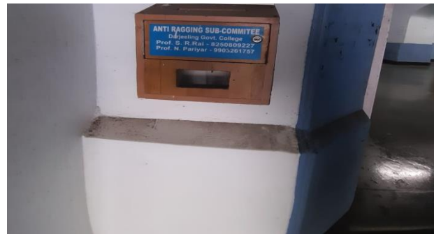
Ragging - Complaint box