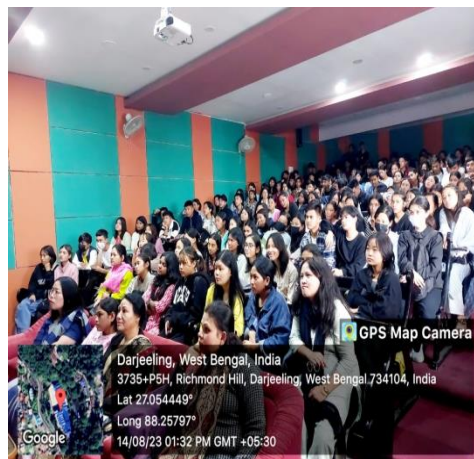
Some glimpses of Anti –Ragging week