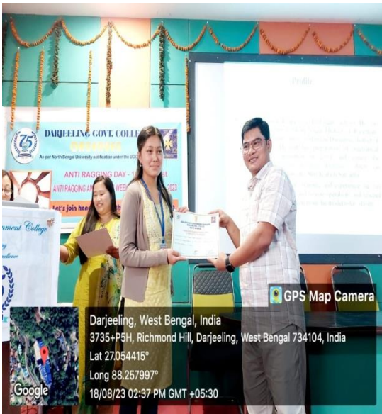
Winner of the competition