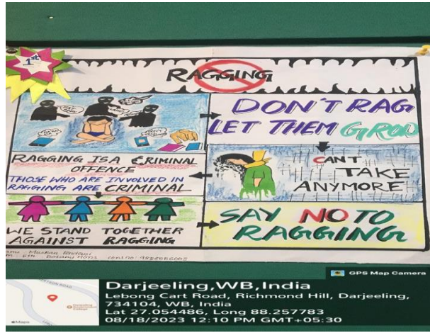
Some posters and essays of the competition