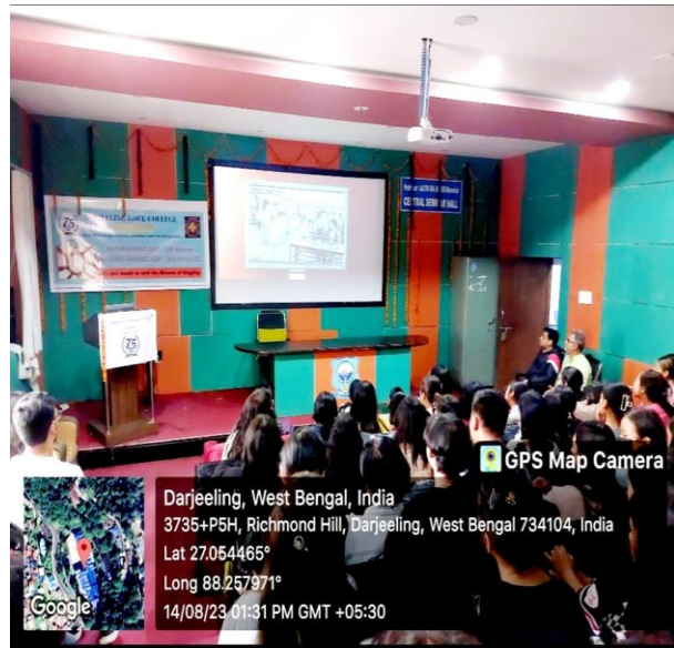
screening of short films on Ragging